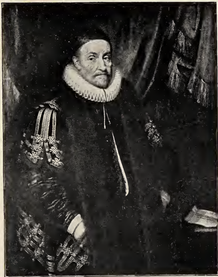
WILLIAM OF ORANGE.

Painting by M. J. Mierevelt, in the Rijks Museum, Amsterdam.